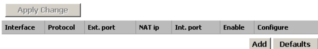
Figure 3. Port Forwarding page.